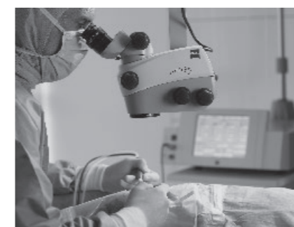
ZEISS quality in cataract surgery – ZEISS OPMI LUMERA 300 best-in-class visualization meets the phaco efficiency of ZEISS Visalis 100