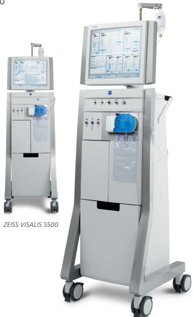
ZEISS VISALIS S500