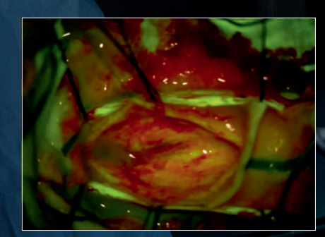
Lumbar spinal tumor with ZEISS YELLOW 5604