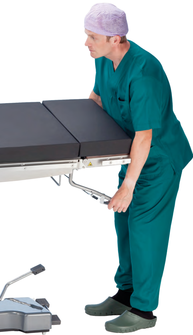
Gas-spring assisted lateral tilt