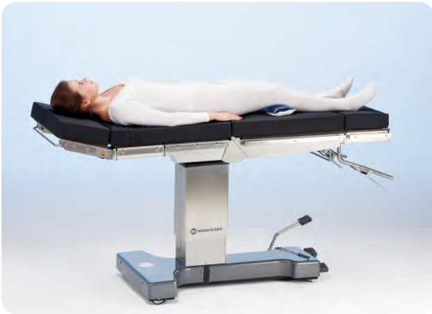
Reverse mode for general or ENT surgery