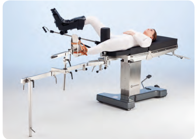
Orthopedic extension device 19300 for trauma surgery

For further details on configurations and accessories, go to www.merivaara.com or contact your nearest Merivaara representative, see the website for contact info.