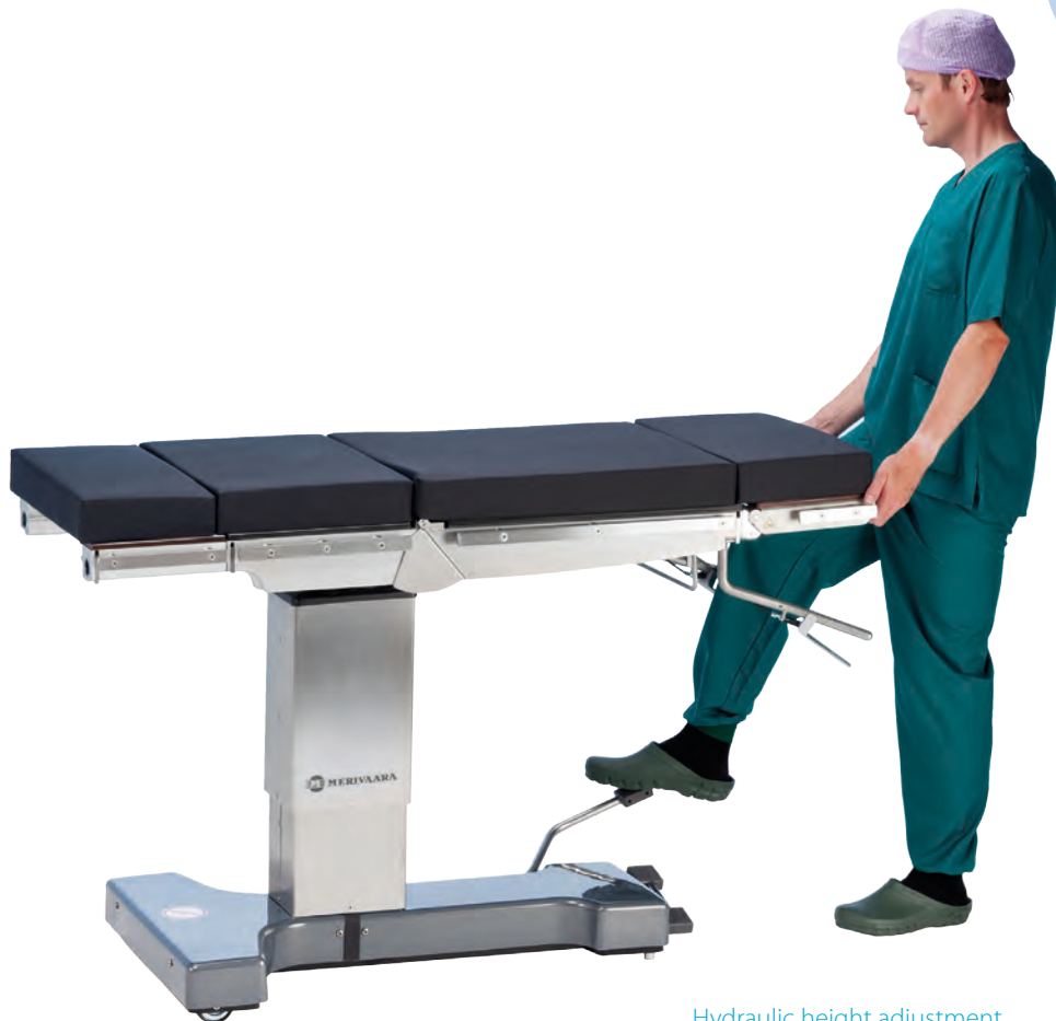
Hydraulic height adjustment