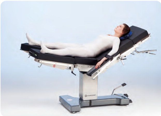
Lithotomy position with divided leg sections for, e.g., laparoscopic and bariatric surgery