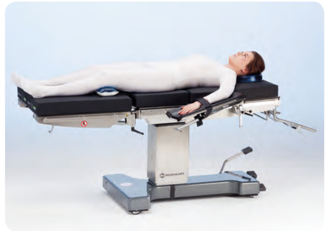
Supine position for general surgery