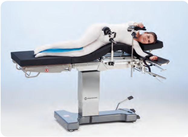
Lateral position for kidney/thorax procedures with integrated kidney bridge seat/back section or with separate kidney elevator -accessory.