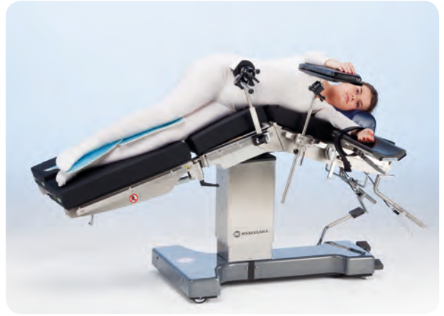
Lateral position for general surgery without kidney elevator.