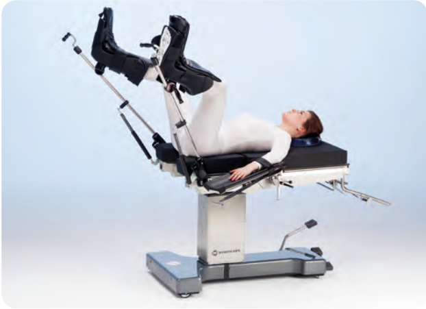
Lithotomy position with stirrups and leg rests for, e.g., GYN and urology surgery