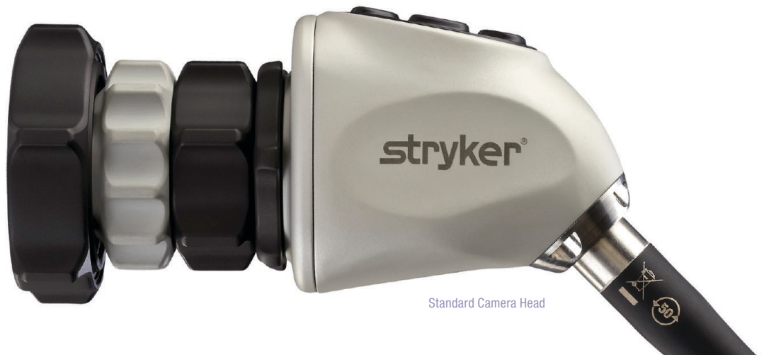
Standard Camera Head